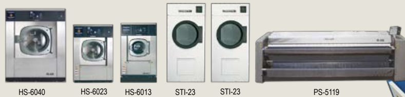
HS-6040 HS-6023 HS-6013 STI-23 STI-23 PS-5119 S/AAR

Auxiliary elements: TTB1 table, ETDB-2 shelf, B-80 cart, Selection cart