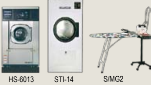
HS-6013 STI-14 S/MG2

Auxiliary elements: TTB1 table, ETDB-2 shelf, B-80 cart, Selection cart.