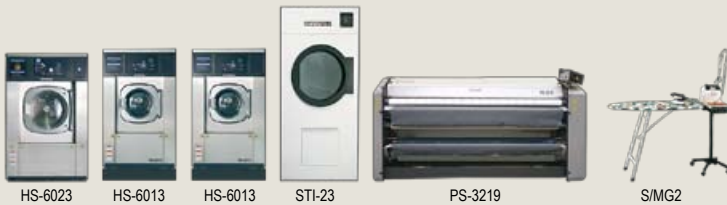
HS-6023 HS-6013 HS-6013 STI-23 PS-3219 S/MG2

Auxiliary elements: TTB1 table, ETDB-2 shelf, B-80 cart, Selection cart