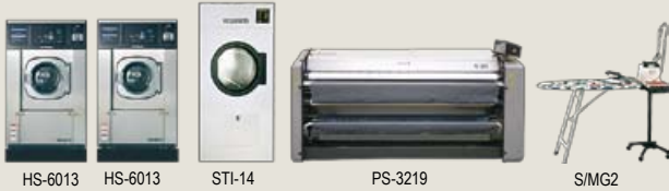
HS-6013 HS-6013 STI-14 PS-3219 S/MG2

Auxiliary elements: TTB1 table, ETDB-2 shelf, B-80 cart, Selection cart