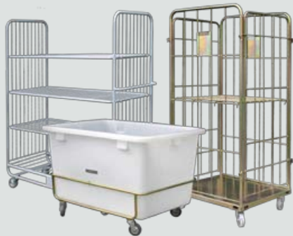
TRANSPORT AND DELIVERY OF CLEAN LINEN Specific carts for clean linen help classification, thereby improving linen distribution in the plant